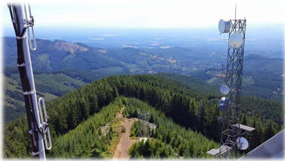
Capitol Peak, South Puget Sound Region