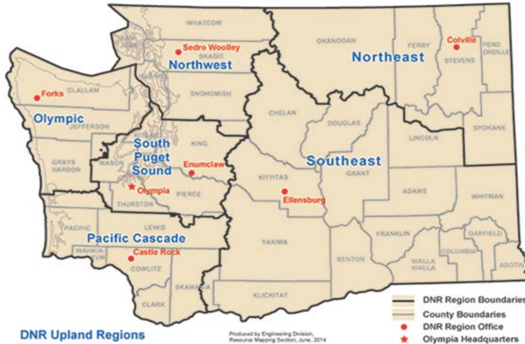
Map of DNR Regions and Offices