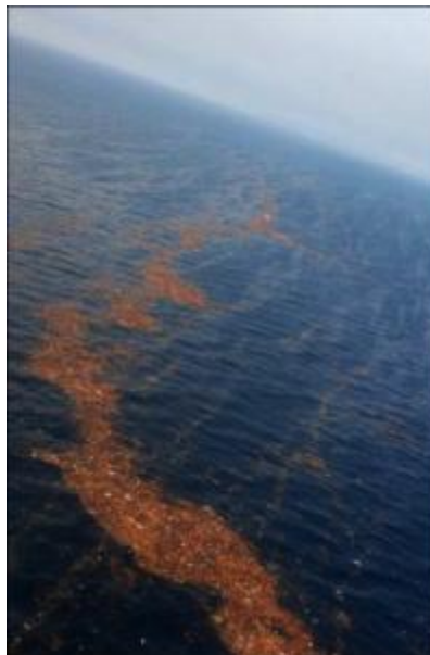
The mass of debris stretches for miles off the Honshu Coast.

The town and people of Onagawa decided on June 10 [2011], to leave four reinforced-concrete buildings in order to make future generations not forget the tsunami disaster.