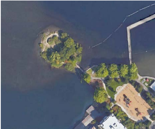
Aerial photo of Bird Island on the south east shore of Lake Washington.

AAMT has supported the DNR Aquatics Restoration Program in completing different types of sediment surveys. The restoration program manages various types of restoration projects and depending on the project, depends on the needs for sediment survey support from AAMT. Some examples of how AAMT has supported the DNR Restoration Program with sediment surveys are detailed below.